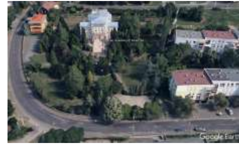
Magyar Tudományos Akadémia Pécsi Területi Bizottsága Pécs, Jurisics Miklós u. 44