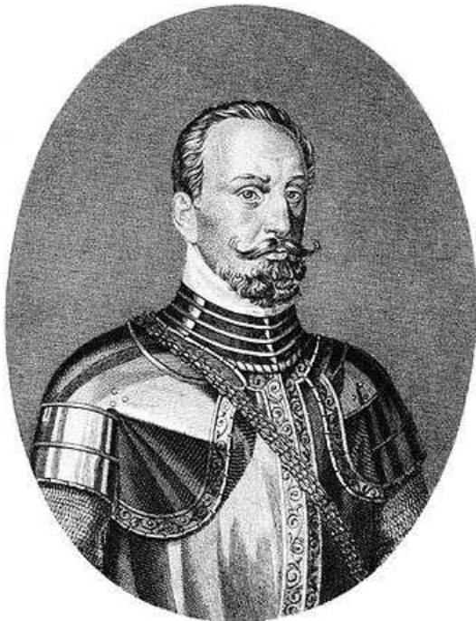
Jurisics Miklós (Nikola Jurišić, Senj Croatia))

An officer of Ferdinand I of Habsburg's troops deployed in Croatian forts in defense against the invasion of the Ottoman Empire under Suleiman I, advancing towards Vienna. Between 1522 and 1526.